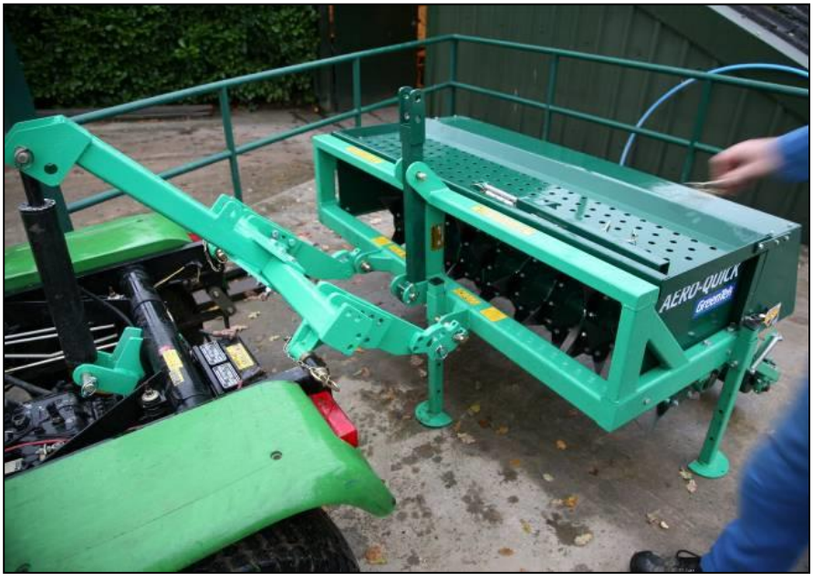
GreenTek Aero-Quick: Note extra top link extension post fitted

Fit the Multi-Mount on to the turf maintenance vehicle, and the top link extension post to the Aero-Quick using the pins and clips provided.