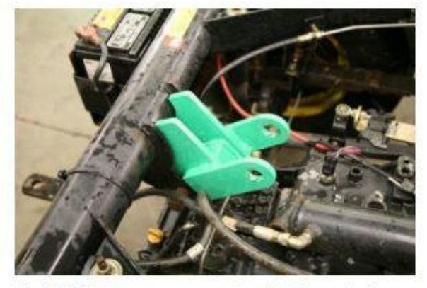
3. Fit the reverse cylinder bracket as shown.

2. This is the reverse cylinder bracket.