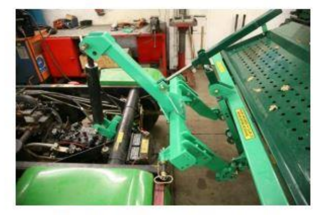
6. Attach Multi-Mount to Pro Gator as shown and connect the hydraulic cylinder.